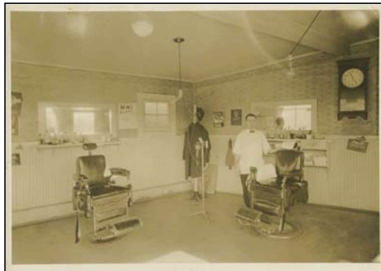
Orrico Barber Shop, circa 1933