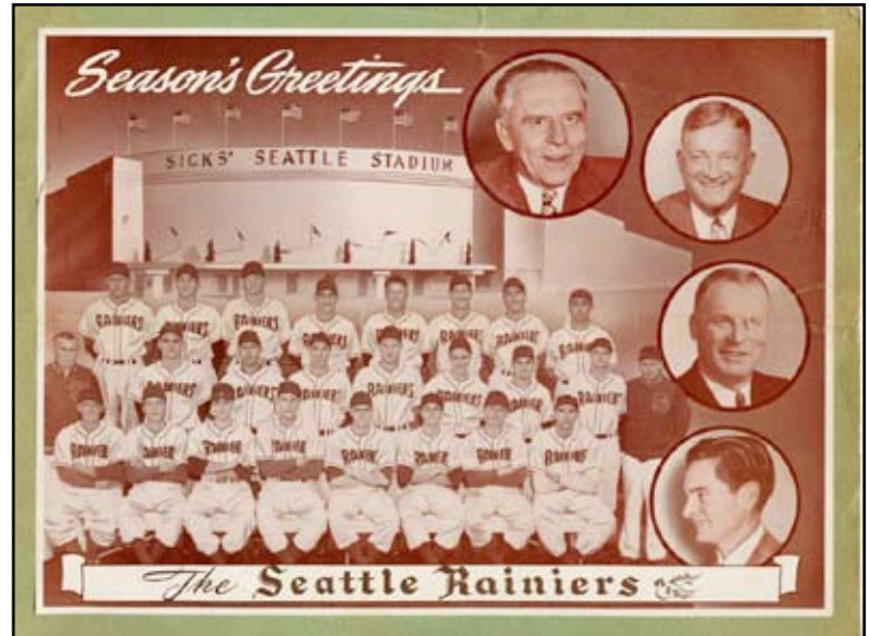
Seattle Rainiers Christmas Card, 1949