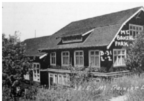
Mount Baker Community Club