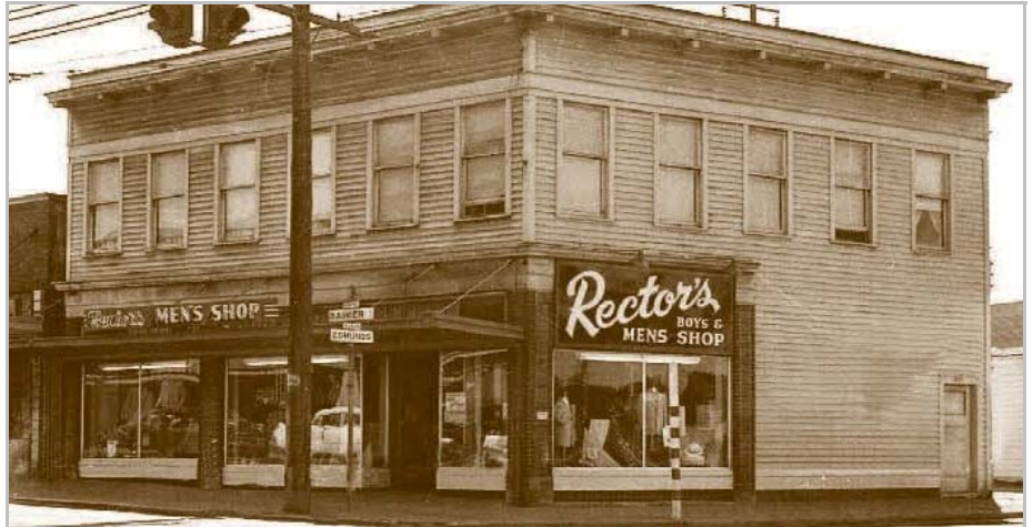
The building that would become Rector's was constructed in the spring of 1912 at a cost of $4,000.