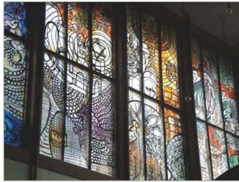
Synagogue Bikur Cholim–Machzikay Hadath

"I see myself right in front of the synagogue waiting, just waiting. The doors open and I see thousands of different pictures, statues, metal plates for death and birth. The synagogue is a beautiful place for worship." — Jordan, 6th grader