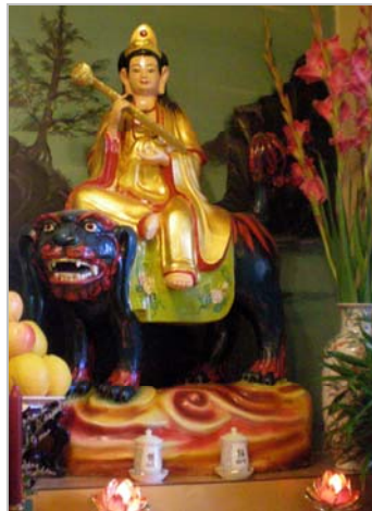
Buddhist Temple, Chua Duoc Su

Altogether the students visited seven faith groups throughout the Rainier Valley. In addition, they received a personal visit by members of a Haida Christian group who explained how their Native American spirituality has blended with the Christian tradition.