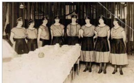
"The Mess Hall Girls," Woodmen Hall?, circa 1915.