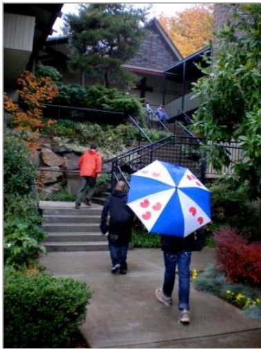
Blaine Japanese Methodist Church