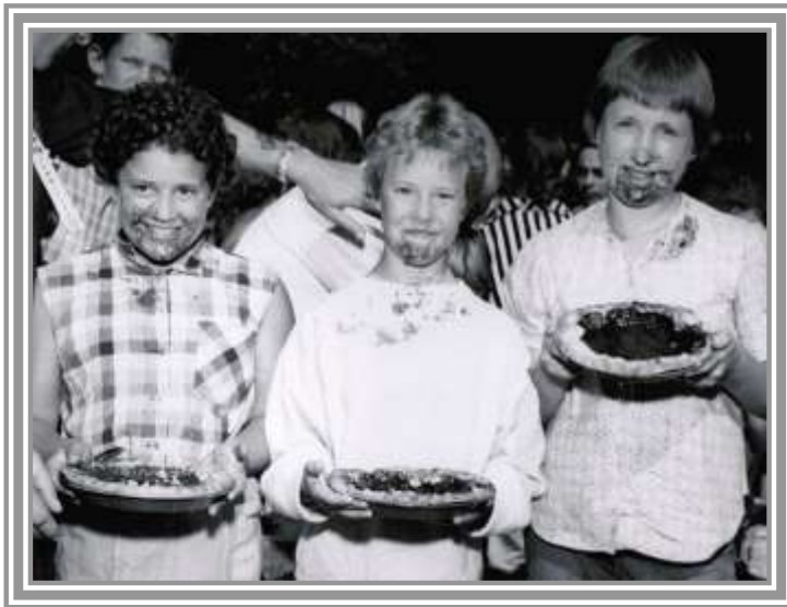
Pie-eating contestants, Pow Wow.

2011 marks the 100th anniversary of the City of Seattle's purchase of Seward Park from private ownership. Local organizations are hosting centennial events throughout the year to celebrate this milestone.